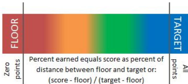
Figure 1: Floors, Targets, and Scores